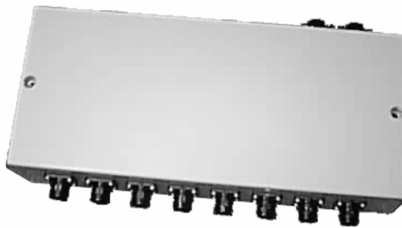
Acquisition unit RR8Ti-1

Acquisition unit RR8Ti-1 serves for data processing and recording. It allows connection of up to eight Sensor amplifiers. Data collected from the Sensor amplifiers are evaluated using Rain-flow method and the individual numbers of stress cycles with corresponding mean values of strain range are sorted into 31×31 classes and stored. Up to 2^{32} (more than 4 \times 10^9 ) cycles can be recorded in each class. It allows extremely long monitoring time without need to collect data and clear the memory. Acquisition unit contains high-precision A/D converter and high-capacity non-volatile data memory for storing collected data even in the case of power loss. Adjustable sampling rate in the range 0.8 - 200 samples per second allows evaluation of fast strain changes. Continuous temperature recording is possible using built-in temperature sensor with the precision \pm 1^\circ\text{C} . Temperature sampling interval is adjustable in the range 1 - 250 s. Acquisition units with different number of channels, external temperature sensor, etc. are available.