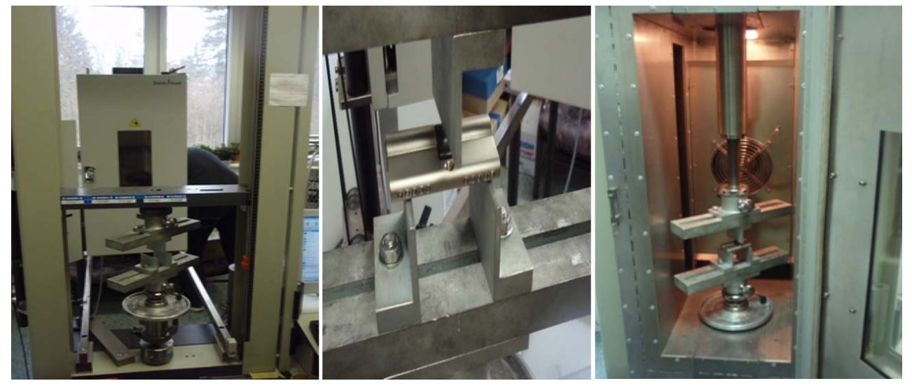
Fig. 1: Testing of cylindrical locks outside and inside the thermal chamber.

The measured values of the break resistance were within the range from 2630 to 2150 N. It is obvious from the values that critical stress increases as a result of increasing temperature and distribution of the applied force into the neighbouring zone of the fracture defined by plastic deformation. The increase in the critical stress in the negative region of the temperature axis due to higher elastic modulus is also of interest. The escalation of the critical stress for the specified area is very significant. The samples tested for break resistance were subjected to fractographic analysis in order to define the type of fracture resulting in the destruction of the cylindrical lock. Specifically they were specimens tested at -20°C and +40°C, i.e. the suprema and infima samples of the selected temperature interval. Substantial differences in the tested samples were already obvious from the macroscopic point of view. The analysis revealed a difference between both fractures where in the case of the cooled down sample (temperature -20°C) the style of deformation corresponded to brittle fracture while the warmed up sample (temperature +40°C) showed a process of considerable plastic deformation (Fig. 2).