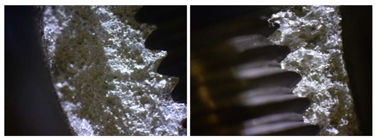
Fig. 3: Microscopic close-up of the fracture (-20°C).

The micro-fractographic analysis was carried out using the Carl Zeiss Jena light microscope equipped with a video camera connected to a computer. The tested objects were lit by an illumination arm in order to emphasise details. The surface images for microscopic analysis were obtained at 15-fold magnification. The application of higher, 50-fold magnification, was rejected due to significant differences in height of the fracture areas surfaces which made required focusing of the image impossible (Fig. 3).