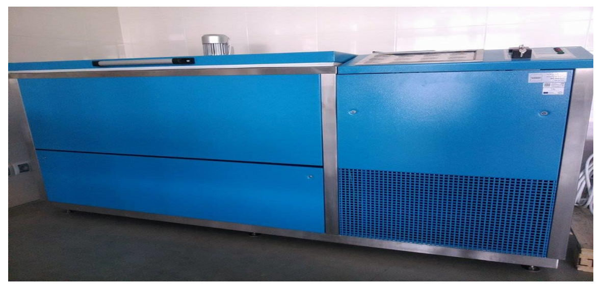
Fig. 1: The equipment for testing freeze – thaw resistance

The compressive strength, tensile strength and dynamic modulus of elasticity were measured after 50, 75 and 100 freeze – thaw cycles. The dynamic modulus of elasticity was tested nondestructive by the ultrasound method according to [6]. The tensile strength was examined on beams according to ČSN EN 12390-5 [7]. The compressive strength was examined on fragments of beams according to ČSN EN 12390-3 [8]. The eguipment, which was used for testing freeze – thaw resistence, is showed in Fig. 1.