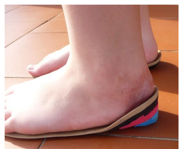
Fig. 3 Formthotics insoles with heel support

anterior part of the foot. In our study, there was a significant change in the trajectory of CoP in the uninjured foot in the 12 months follow up comparing to the 6 months follow up measurement. The trajectory tends to be like in the injured foot and the gait stereotype is changed. This fact is very undesirable from the prospective point of view when the tissue replacement will be done in the future. According to our study we recommend to use orthopaedic insoles with various heel support to eliminate the differences between the plantar pressure distribution under the injured and uninjured foot (Fig. 3) and to ensure the right gait stereotype.