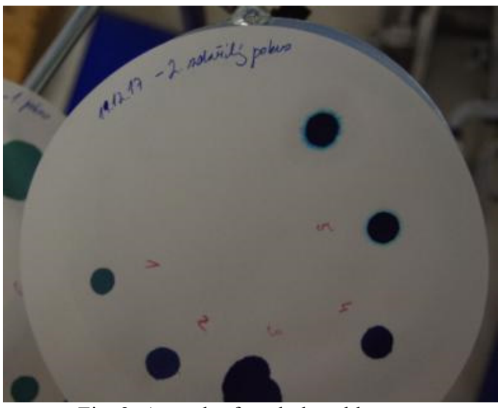
Fig. 2: A result of methylene blue test

Dye solution consumption increases with increasing amount of clay in clay samples. Amount of dye absorbed also depends on a kind of clay. Amount of dye absorbed is determined by the equations 1. Amount of dye absorbed is defined as the amount of weight of dye in gram that is absorbed by 1 kilogram of test material.