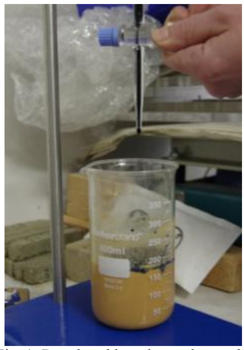
Fig. 1: Dye dosed into the earth sample

This process is repeated and each sample drop with increasing amount of methylene blue solution is marked (Fig. 2). Methylene blue test is finished when a blue ring spreads around a drop sample (mark 5 in Fig. 2) because clay has already absorbed the maximum amount of methylene blue.