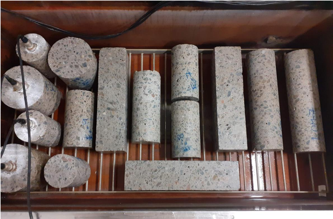
Fig. 1: The layout of the test specimens in a freezing device during the frost resistance test.

To carry out the acoustic emission measurements, a single acoustic emission sensor was attached to the upper base of each specimen as shown in Fig. 1.