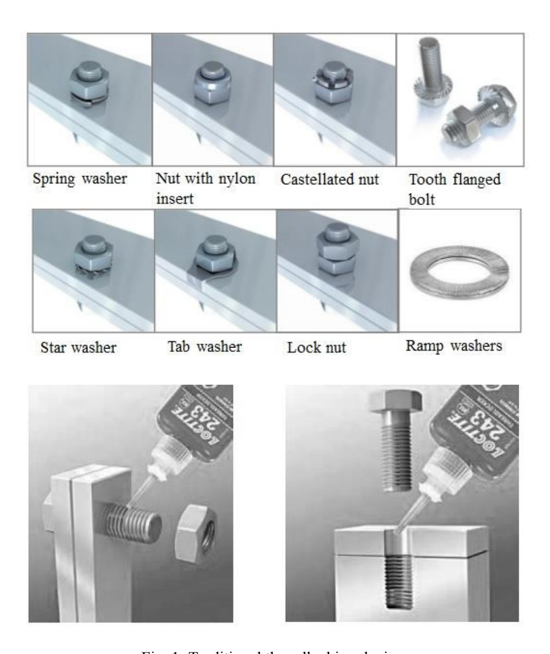
Fig. 1: Traditional threadlocking devices